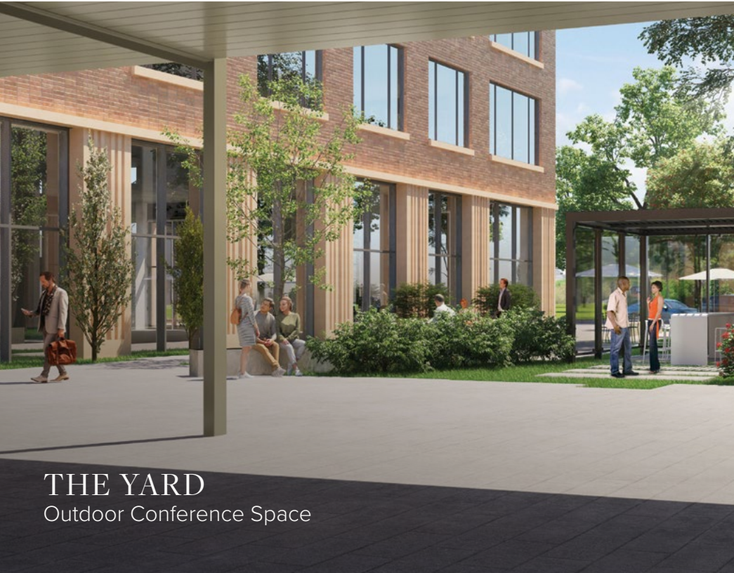
THE YARD Outdoor Conference Space