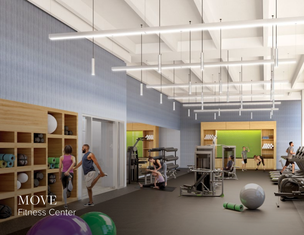
MOVE Fitness Center