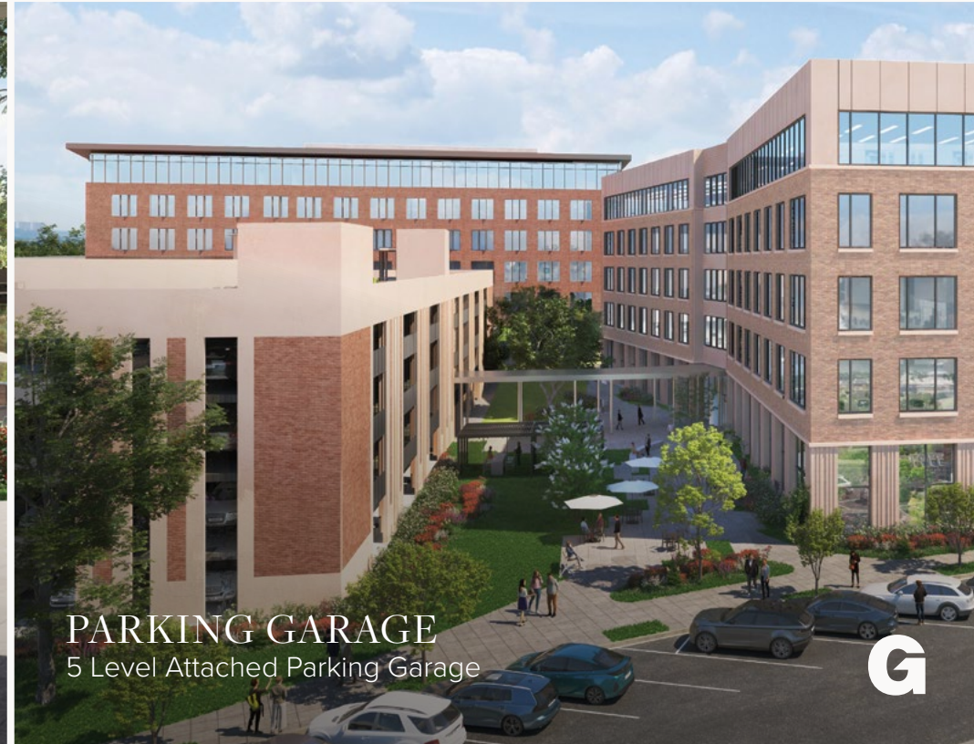
PARKING GARAGE 5 Level Attached Parking Garage