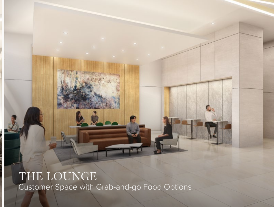
THE LOUNGE Customer Space with Grab-and-go Food Options