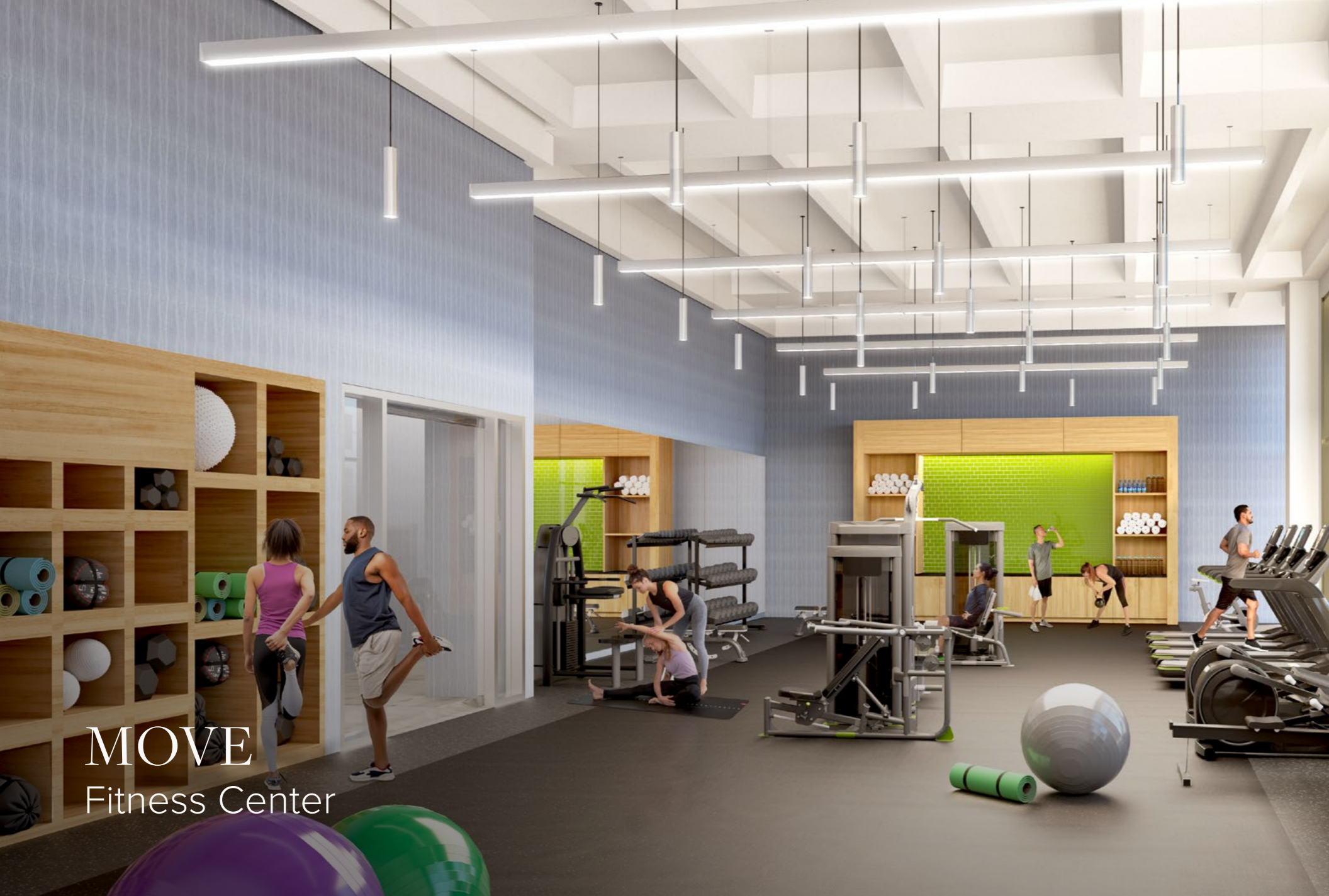
MOVE Fitness Center