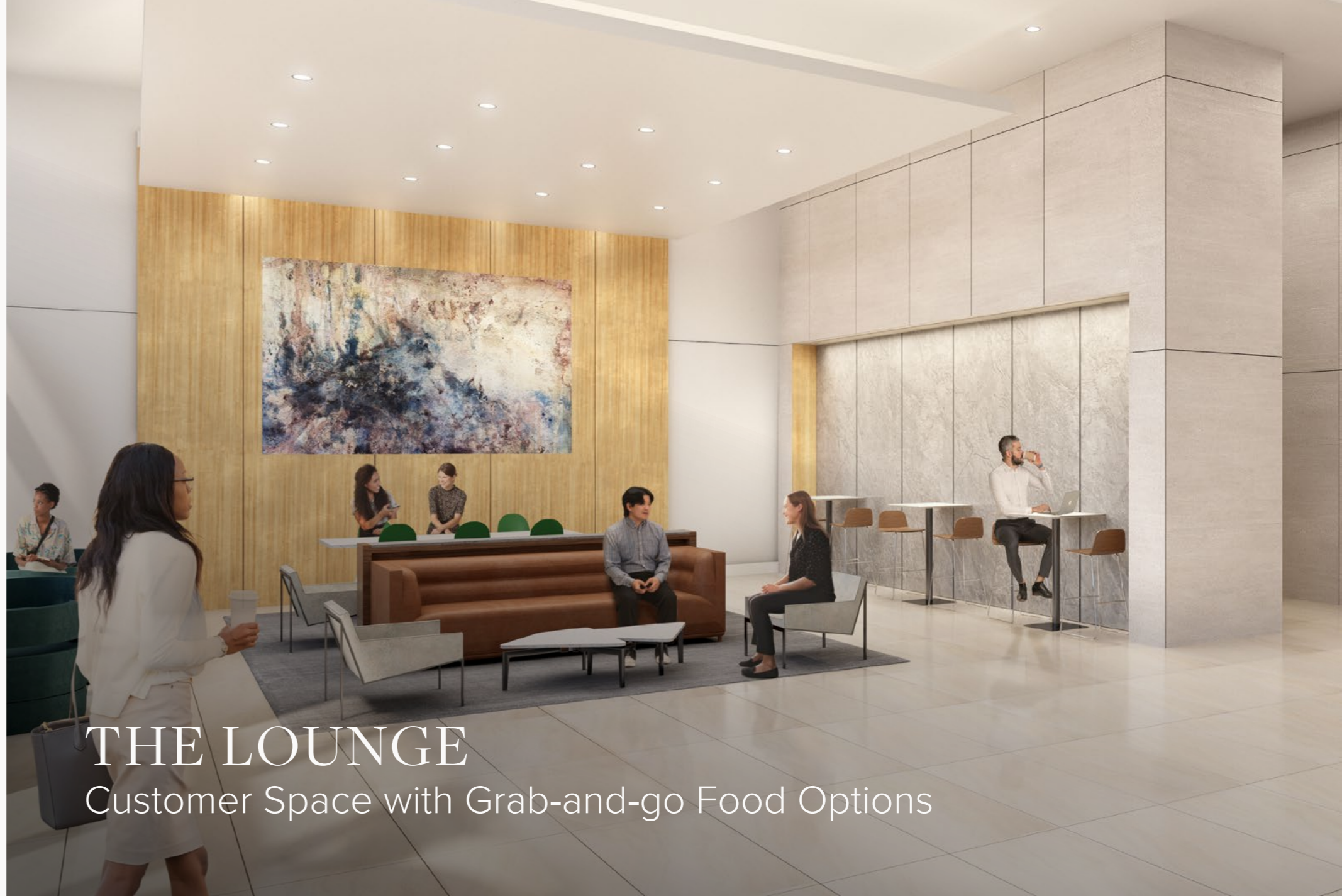
THE LOUNGE Customer Space with Grab-and-go Food Options