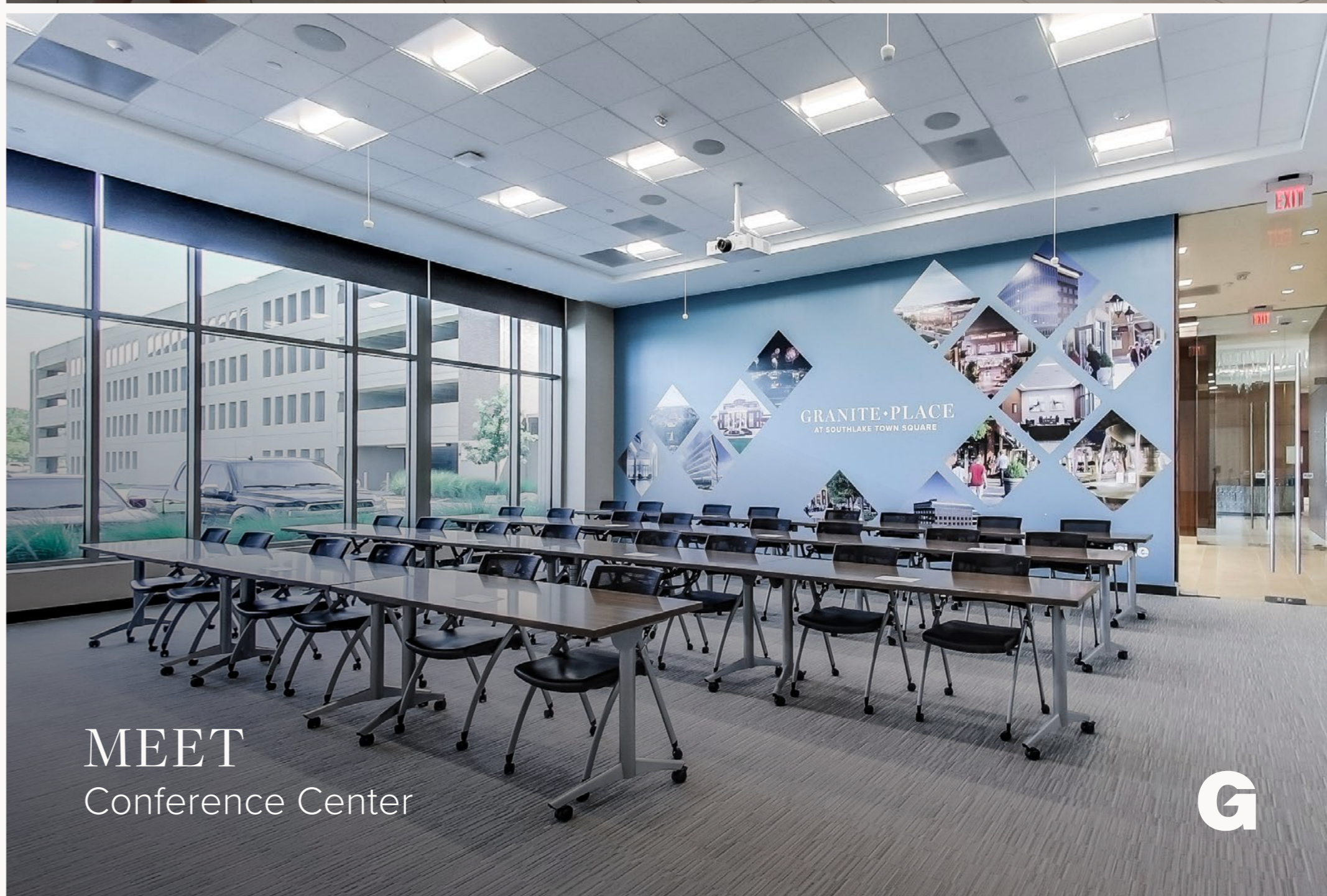
MEET Conference Center