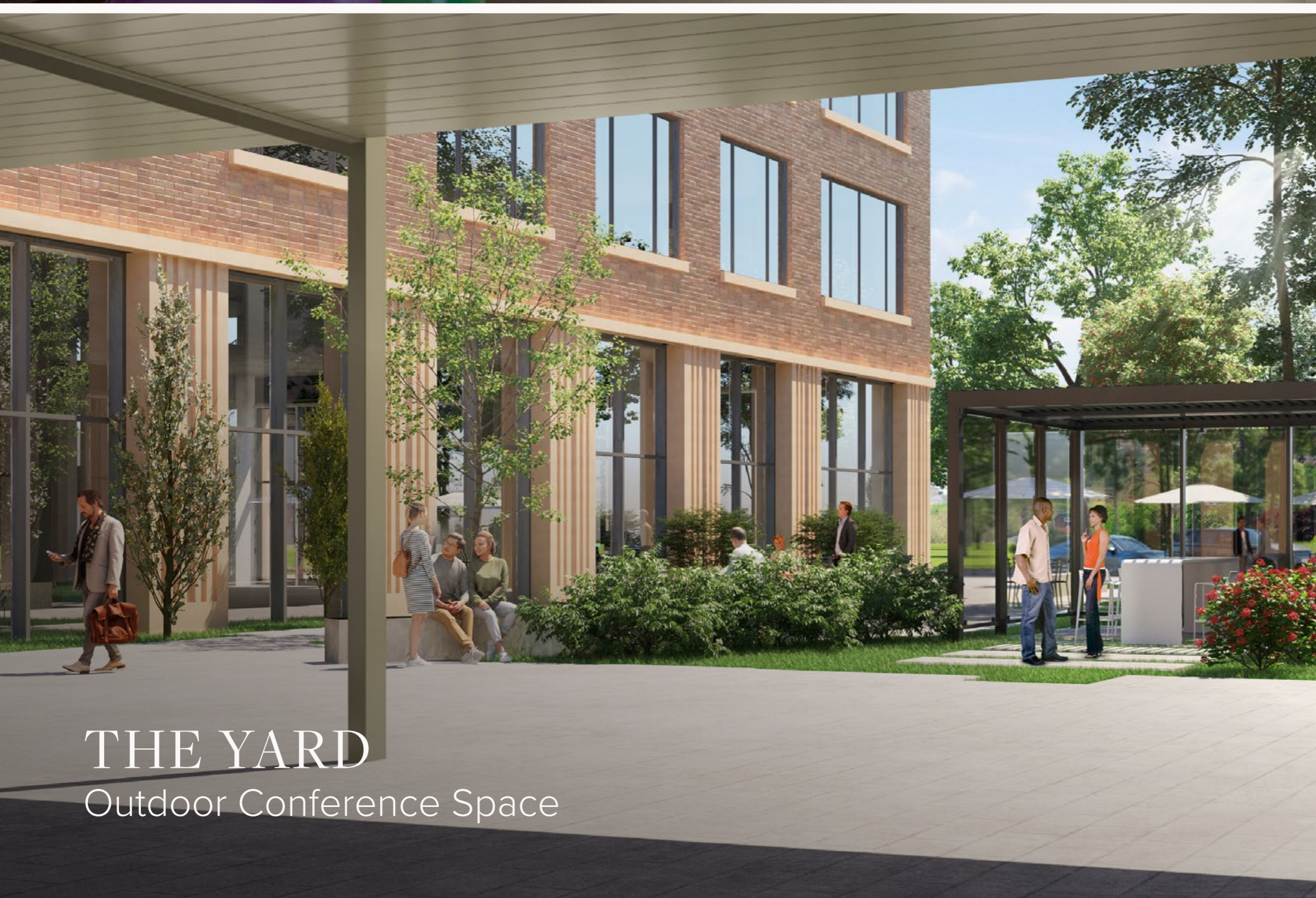
THE YARD Outdoor Conference Space